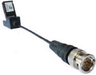
Quick Connect Video Balun BNC Male to IDC Part Number: E10180TC