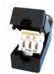
Rear View showing IDC